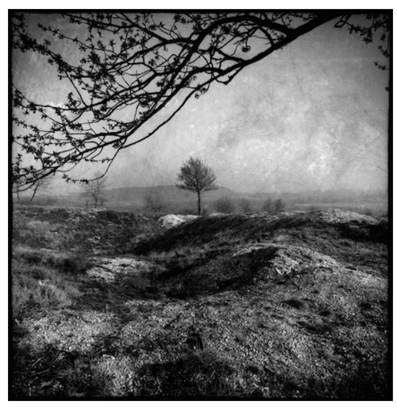
#103 - Massiges- Marne - Meuse-Argonne offensive

In this last fight, the A.E.F paid the price of 26,277 killed and 95,786 wounded U,S. soldiers.