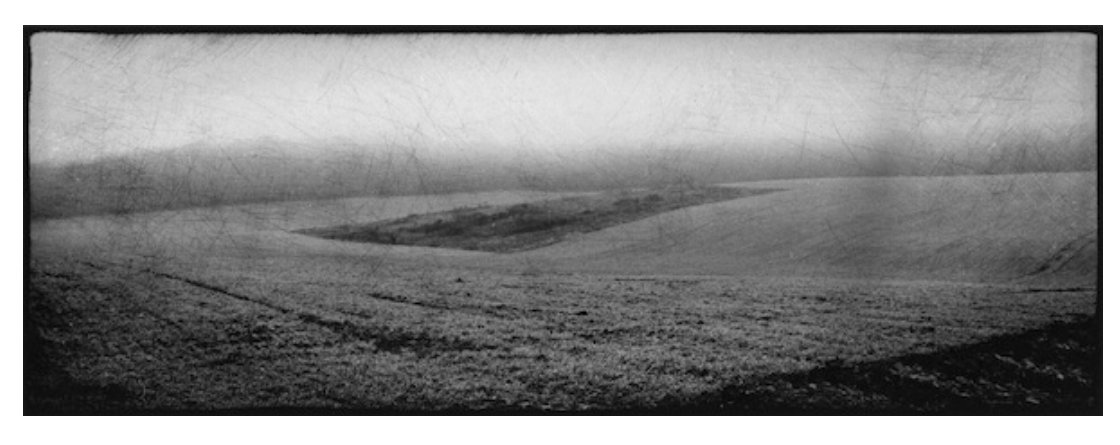
#218 - Between Noroy sur Ourcq and Troesmes, in the background Retz wood - Battle of Aisne