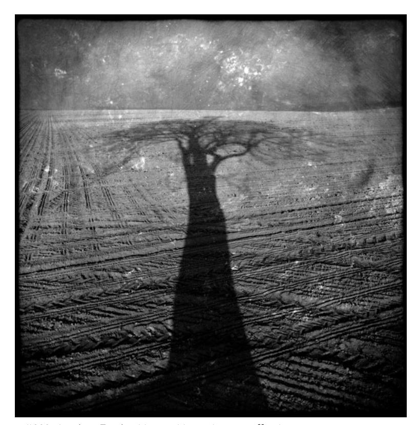
#098 - Laval sur Tourbe- Marne - Meuse-Argonne offensive