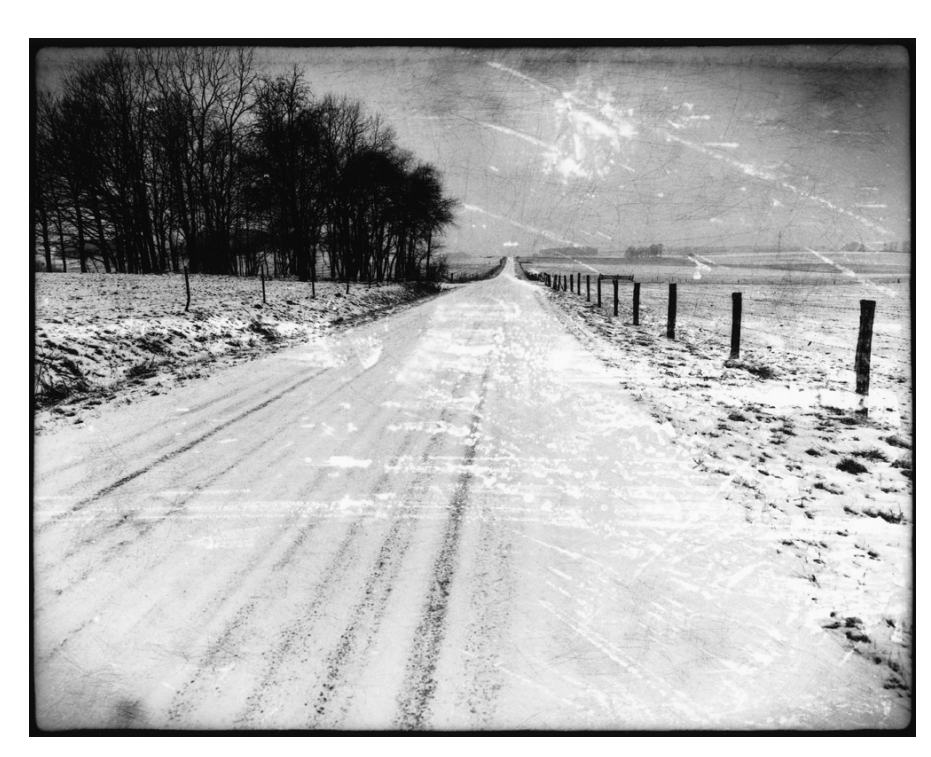
Romagne-sous-Montfaucon- Meuse- Meuse-Argonne offensive

Romagne-sous-Montfaucon's landscape, 100 years after the most murderous battle of all the United States history.