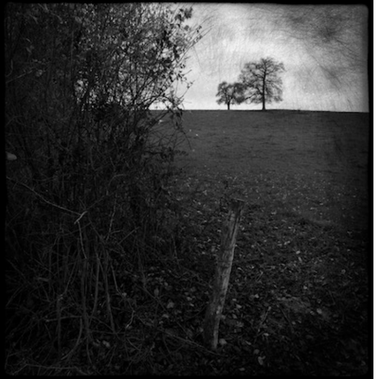
#211 On the Belleau wood's hill, close to Givry, Aisne - Bois Belleau's battle