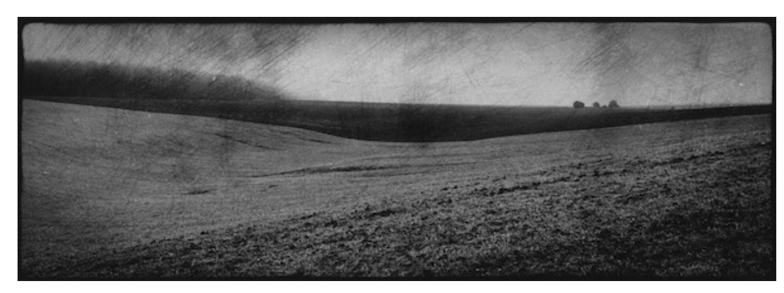
#217 - Between Noroy sur Ourcq and Troesmes, in the background Retz wood - Battle of Aisne

The front line of the Allies with the American troops in July 1918. 125 000 acres of wood were destroyed during the war.