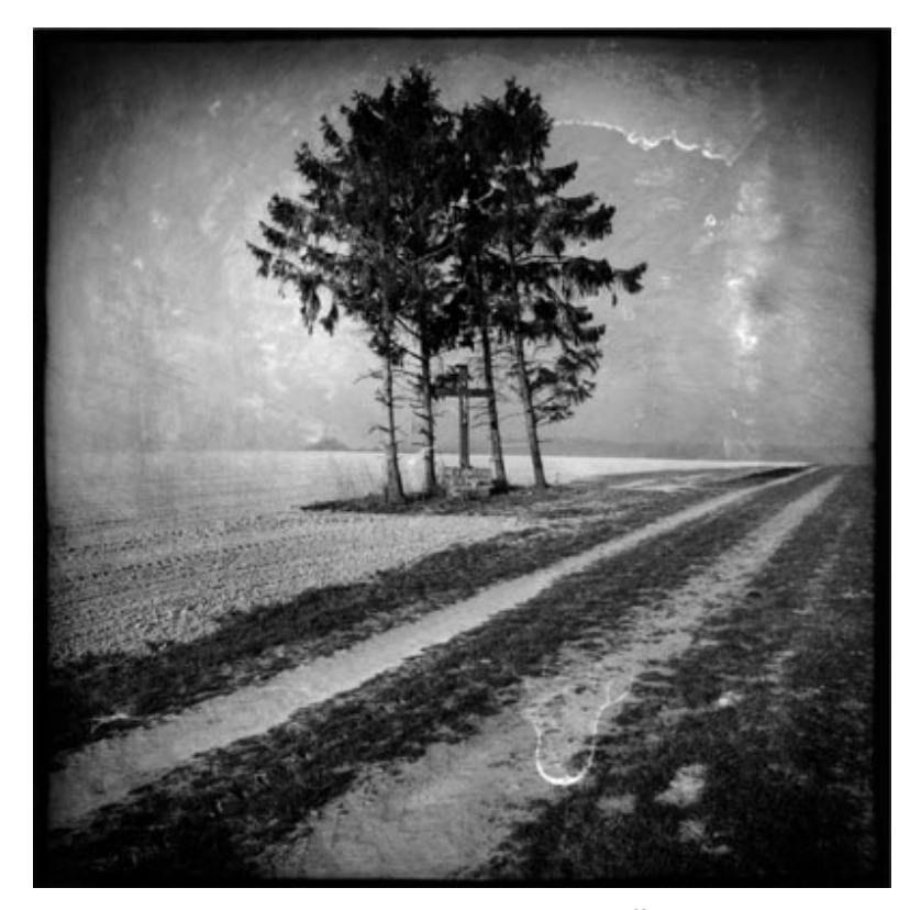
#100 - Wargemoulin-Hurlus - Marne - Meuse-Argonne offensive