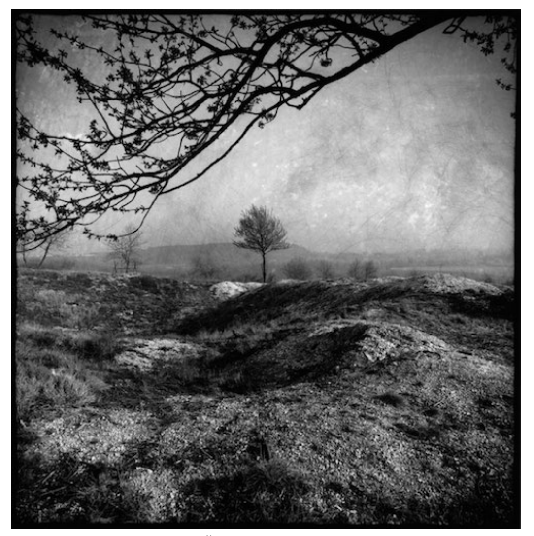
#103, Massiges, Marne - Meuse-Argonne offensive