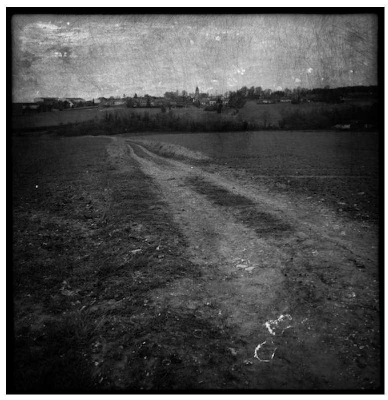
#241 - Cantigny village - Somme - Battle of Cantigny

On May 28, 1918, the 28th Infantry Regiment of the US First Division attacked a German-held French village called Cantigny. The Battle of Cantigny was America's first significant offensive during World War I.