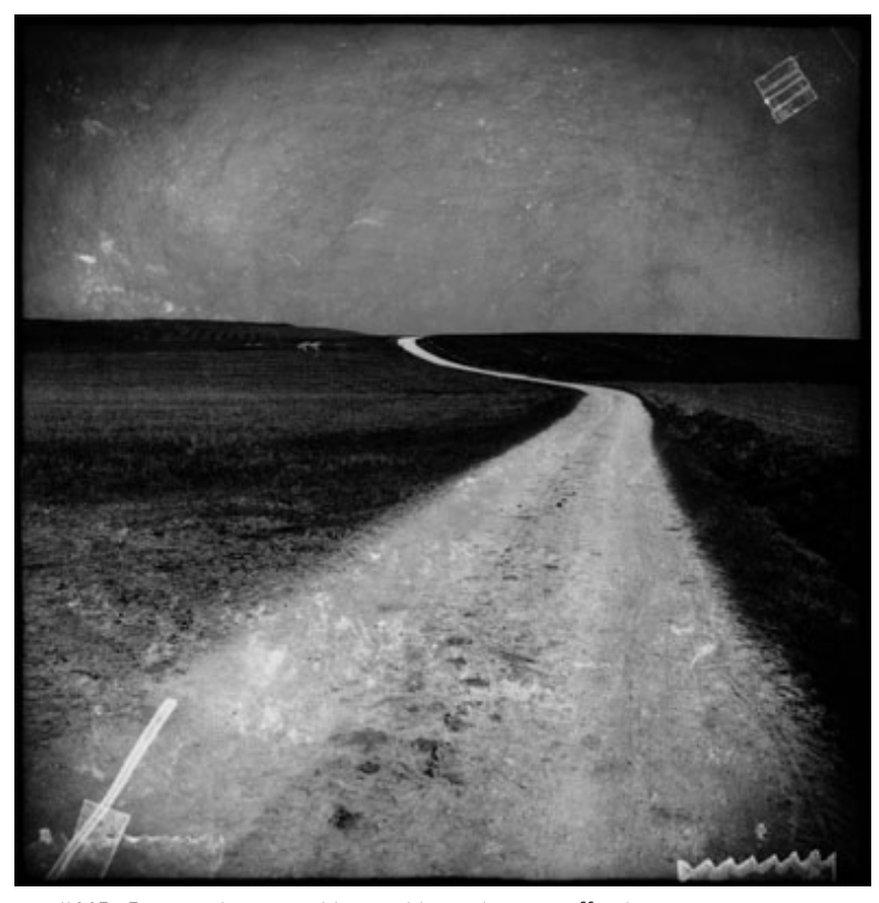
#097 - Esnes en Argonne - Meuse - Meuse-Argonne offensive

The Meuse-Argonne offensive was the largest and the bloodiest operation of the war for the American Expeditionary Forces.