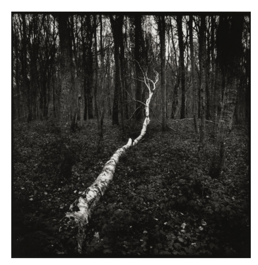
#213 Bois de Belleau, Aisne - Bois Belleau's battle

June 1918 - The Battle of Belleau wood has become the key component of the lore of the U.S. Marine Corps.