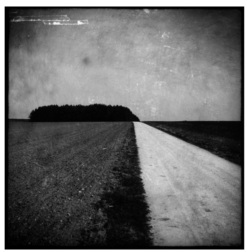
#096 - Esnes en Argonne - Meuse - Meuse-Argonne offensive