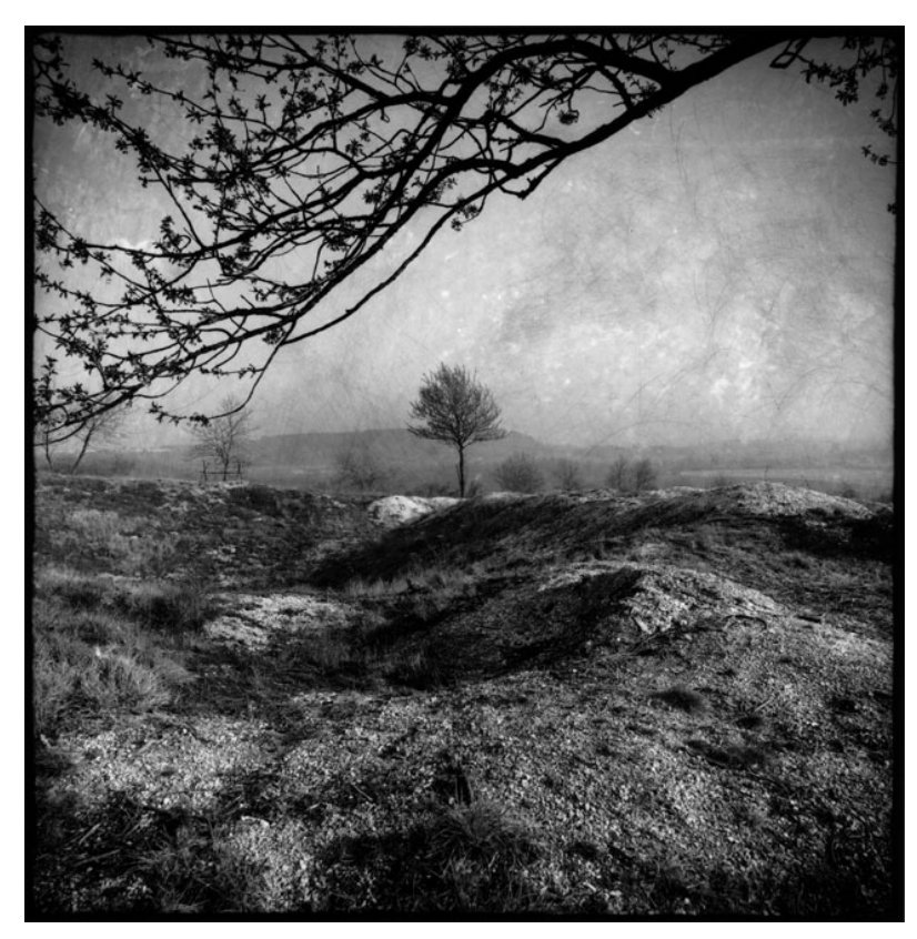
#103 Massiges, Marne - Meuse-Argonne offensive