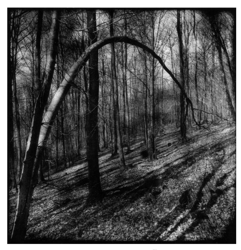
#107 - Forêt d'Argonne - Meuse - Meuse-Argonne offensive