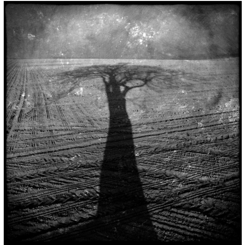
#098 - Laval sur Tourbe- Marne – Meuse-Argonne offensive