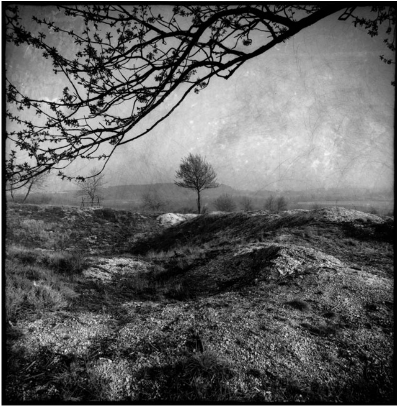
#103 Massiges, Marne – Meuse-Argonne offensive