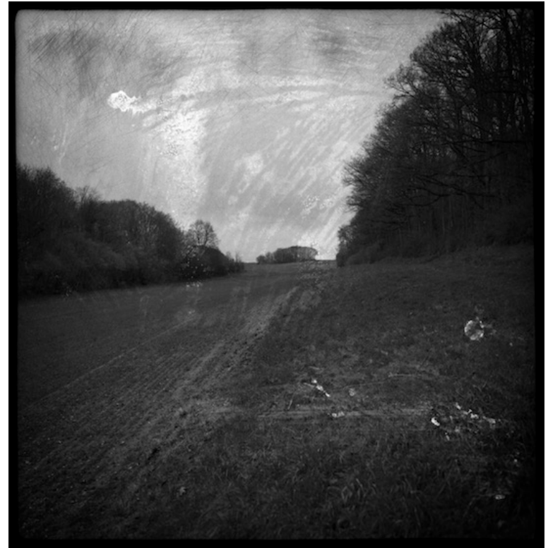
#245 – Cantigny – Somme – Battle of Cantigny