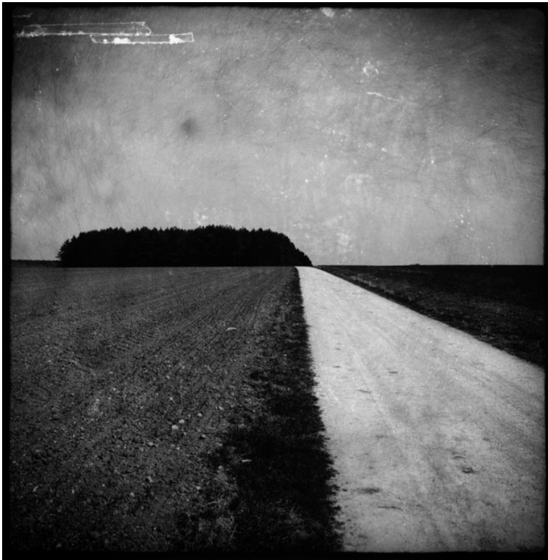
#096 - Esnes en Argonne – Meuse - Meuse-Argonne offensive

The Meuse-Argonne offensive was a major part of the final Allied offensive. Fight lasted from September 26, 1918 until the Armistice of 11 November 1918.