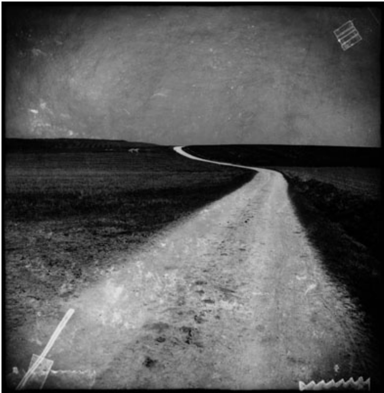
#097 - Esnes en Argonne – Meuse – Meuse-Argonne offensive

The Meuse-Argonne offensive was the largest and the bloodiest operation of the war for the American Expeditionary Forces.