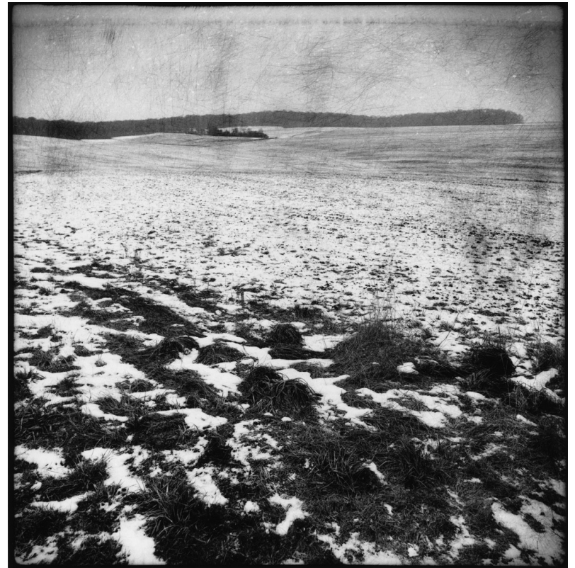
Romagne-sous-Montfaucon- Meuse – Meuse-Argonne offensive