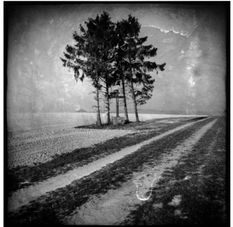
#100 – Wargemoulin-Hurlus – Marne – Meuse-Argonne offensive