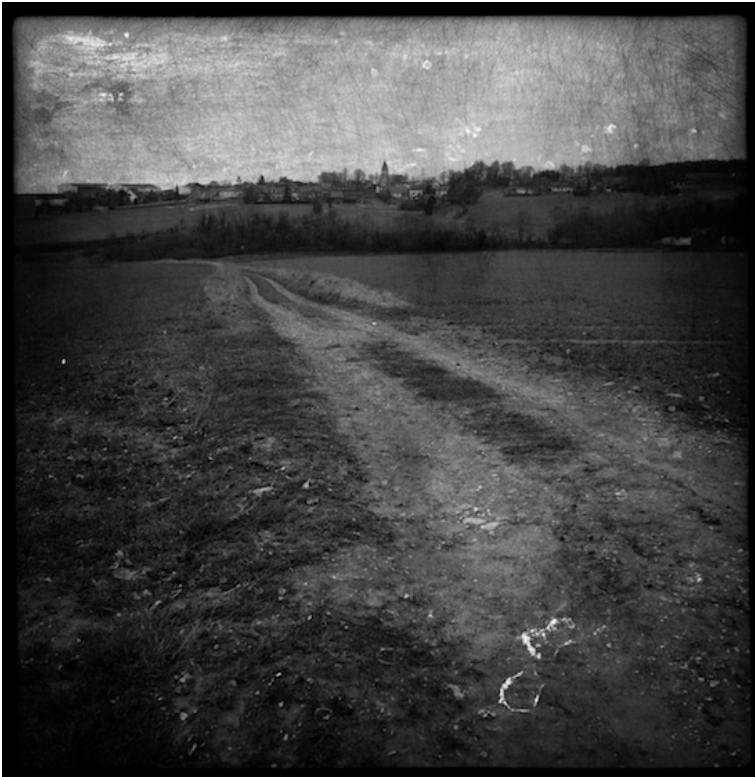
#241 – Cantigny village – Somme – Battle of Cantigny

On May 28, 1918, the 28th Infantry Regiment of the US First Division attacked a German-held French village called Cantigny. The Battle of Cantigny was America's first significant offensive during World War I.