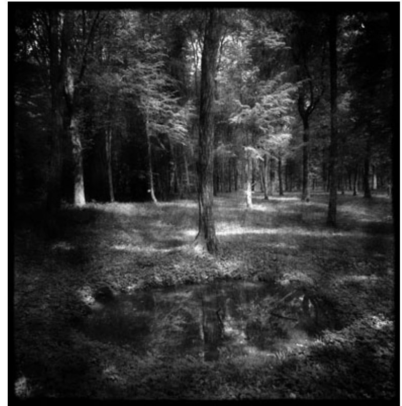
#200 Bois de Belleau, Aisne - Bois Belleau's battle