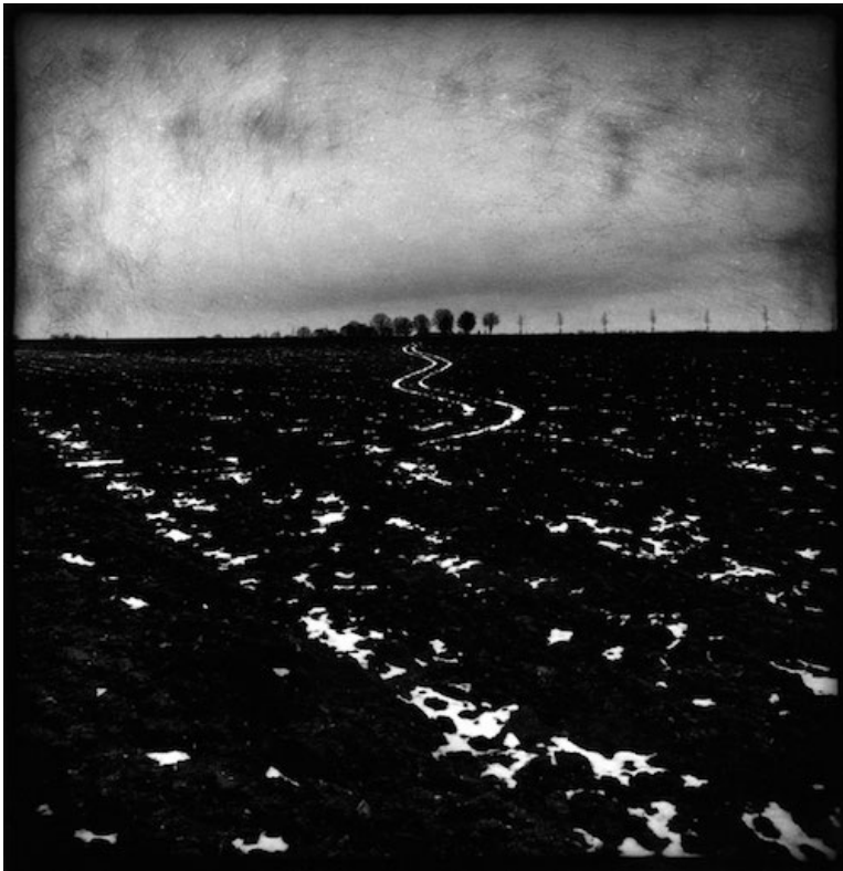
#131 - Le Chemin des Dames – Battle of Aisne

Winter 1917, American troops settled in Chaudun on the Chemin des Dames. May 1918, General John J Pershing, provided precious reinforcement to the French army.