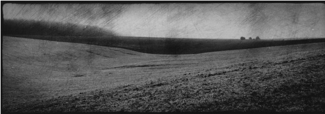
#217 – Between Noroy sur Ourcq and Troesmes, in the background Retz wood – Battle of Aisne

The front line of the Allies with the American troops in July 1918. 125 000 acres of wood were destroyed during the war.