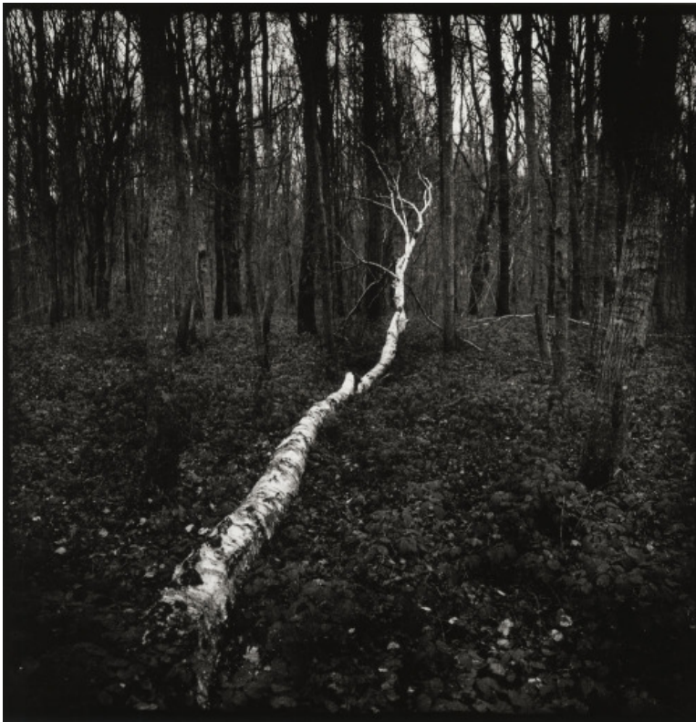
#213 Bois de Belleau, Aisne - Bois Belleau's battle

June 1918 - The Battle of Belleau wood has become the key component of the lore of the U.S. Marine Corps.