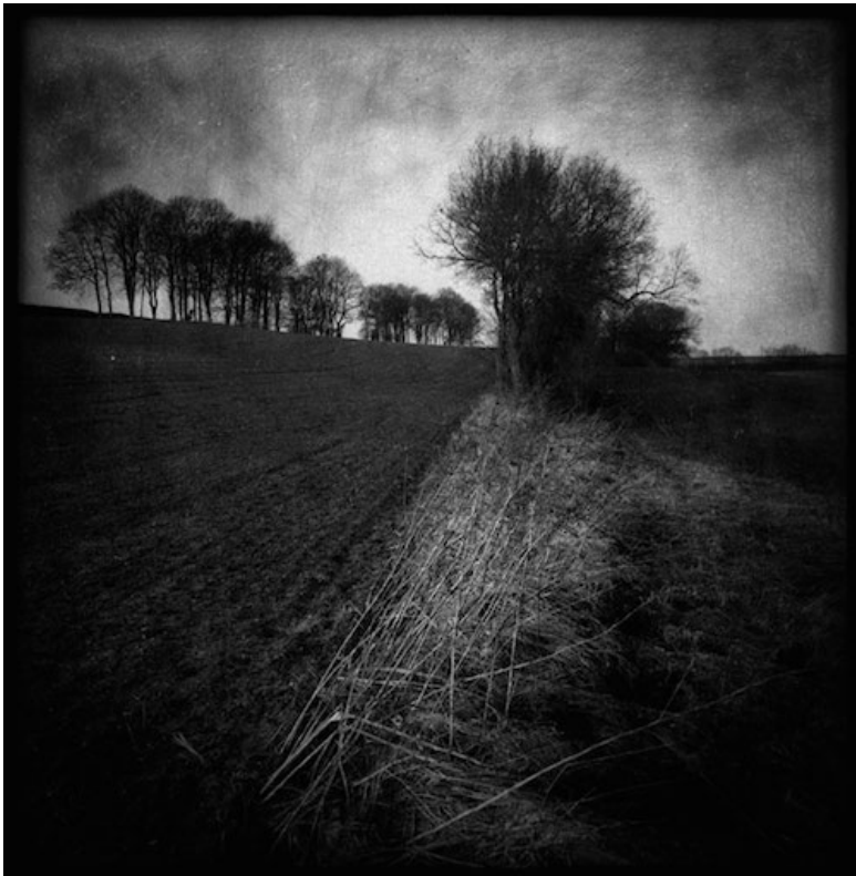
#154 – Hamel – Nord – Battle of Hamel

July 4, 1918, the battle of Hamel was a successful attack launched by several American units and the Australian Corps against German positions.