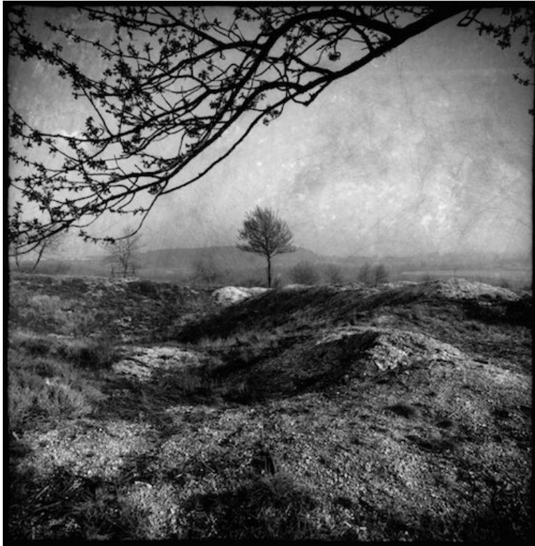
#103 - Massiges- Marne – Meuse-Argonne offensive

In this last fight, the A.E.F paid the price of 26,277 killed and 95,786 wounded U.S. soldiers.