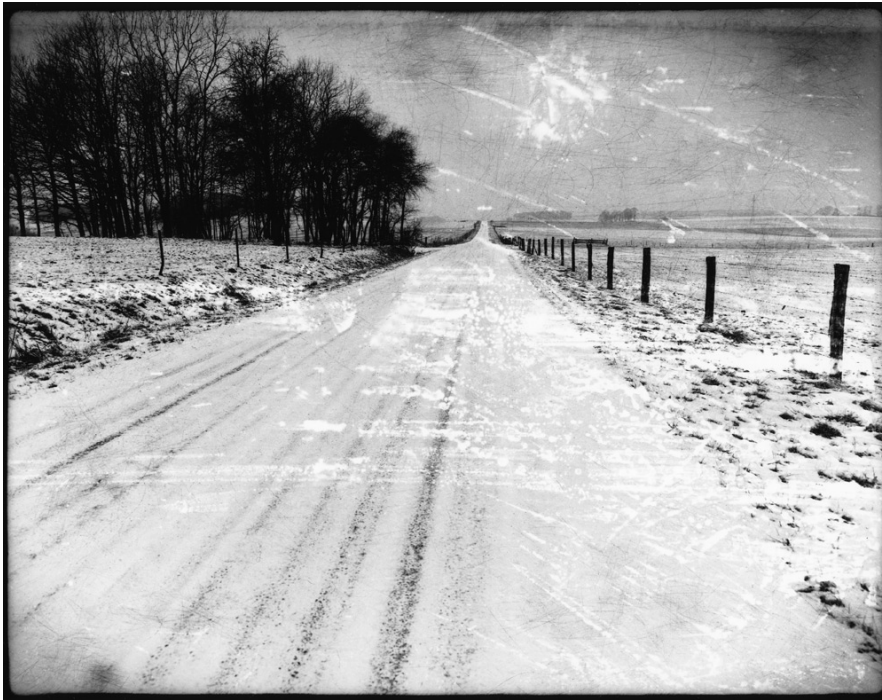
Romagne-sous-Montfaucon- Meuse- Meuse-Argonne offensive

Romagne-sous-Montfaucon's landscape, 100 years after the most murderous battle of all the United States history.