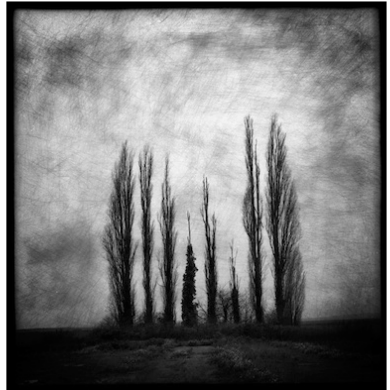
#222 - Le Chemin des Dames – Battle of Aisne