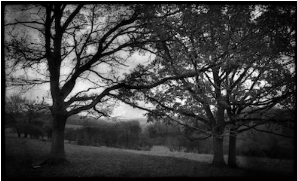
#211 On the Belleau wood's hill, close to Givry, Aisne - Bois Belleau's battle