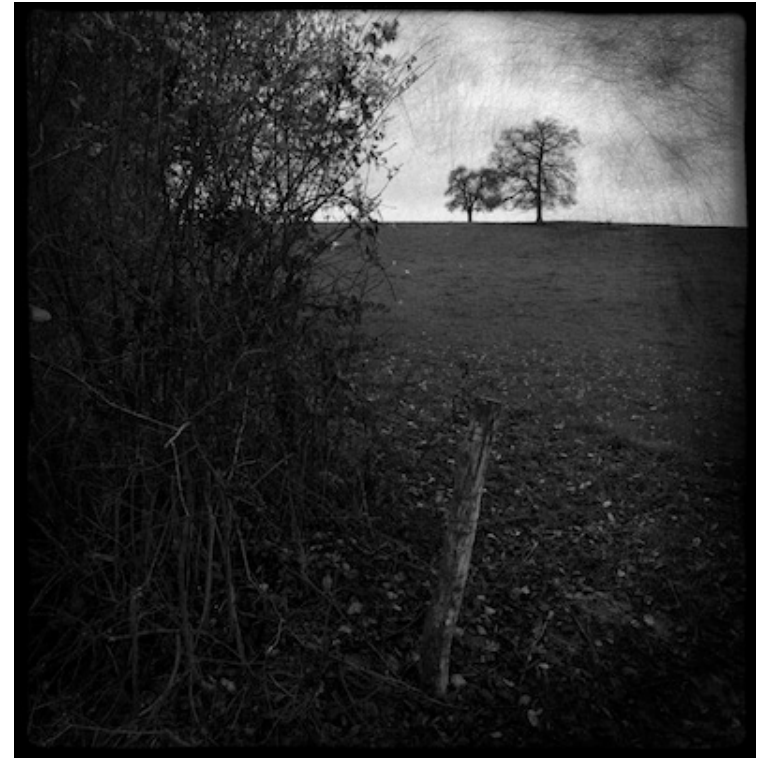
#200 Boursesches, Aisne - Bois Belleau's battle