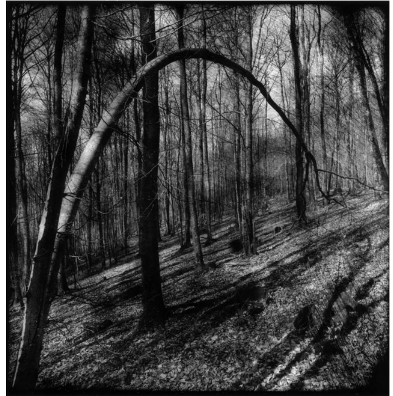
#107 – Forêt d'Argonne – Meuse – Meuse-Argonne offensive