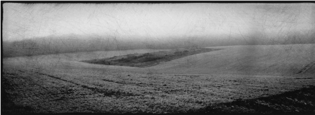
#218 – Between Noroy sur Ourcq and Troesmes, in the background Retz wood – Battle of Aisne